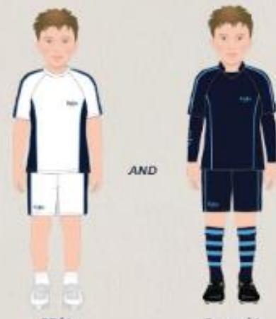
PE kit Tenin rauktimensi, vilin sehesi tega Shartan autolimeters, with some larger Videos acces

Pictures below are of our PE/Games kits for Reception to Year 2.